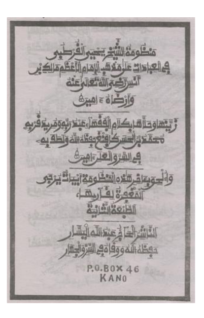
Qurtubi of Yahaya Al-Qurtubi